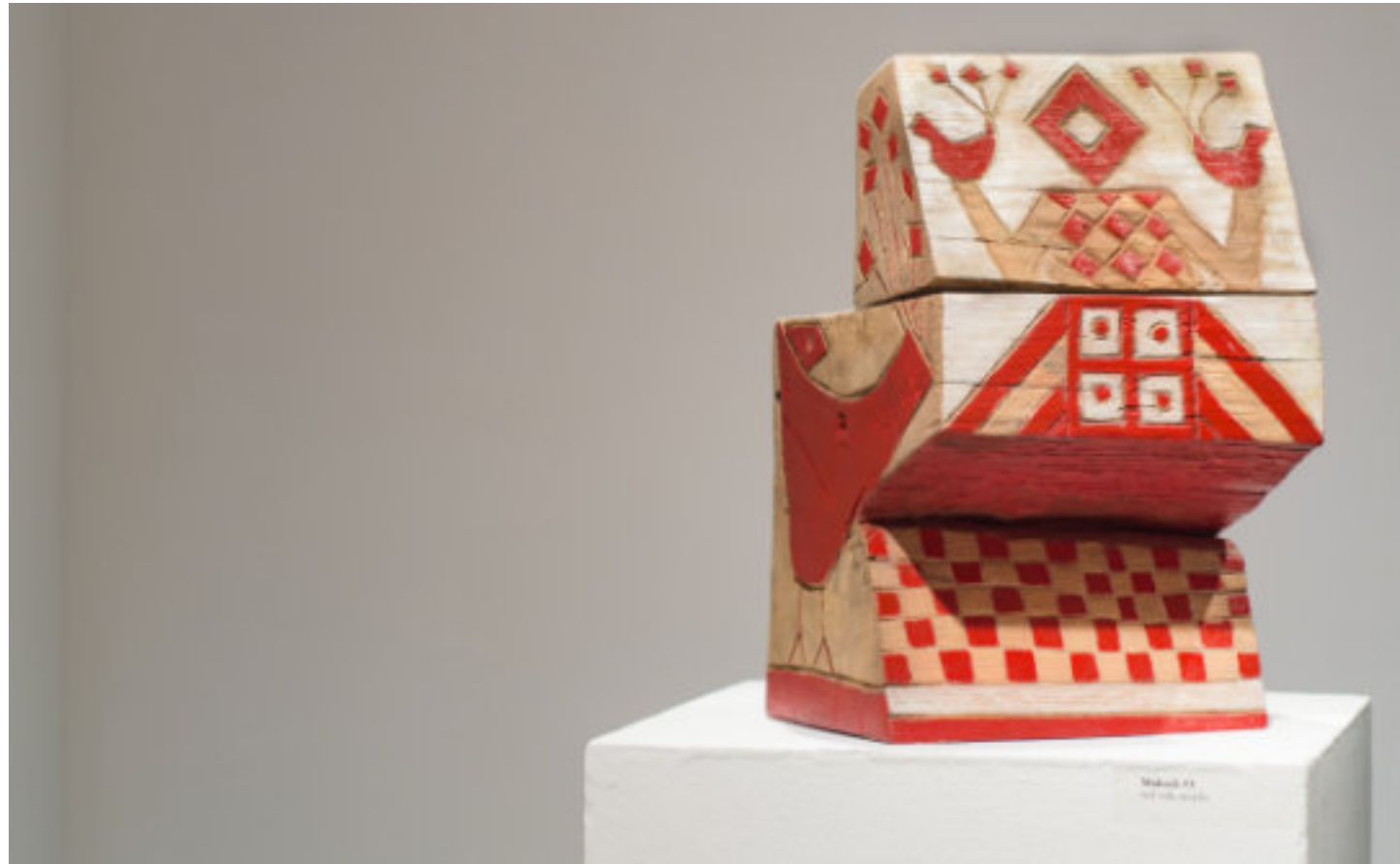
Makosh 3. Acrylic on red oak.