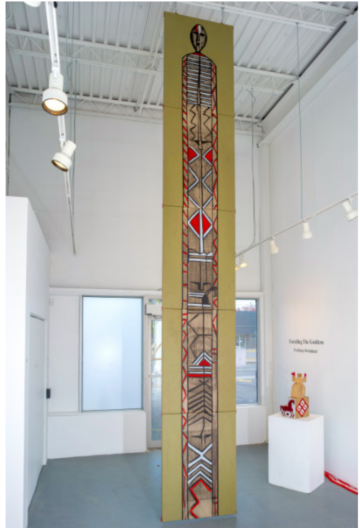
Shigir, 11500 years old wood sculpture. Acrylic on linen.